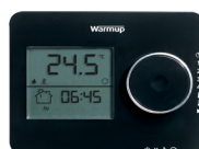
tempo Programmable Thermostat