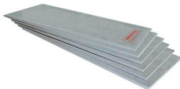
Warmup Insulation Boards