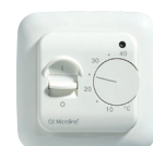
Manual Thermostat MSTAT