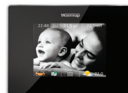
4iE Smart Wifi Thermostat