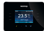
3iE Energy-Monitor Thermostat